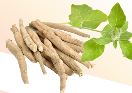
Ashwagandha for improved stress resilience